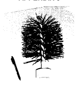
Well scrub brush

Swabbing the casing, not the bore hole, involves the brush being covered with a terry cloth fabric and the swab being pushed into the casing to remove all left over biological growth. The swab must be pushed down to the bottom of the casing. Swabbing should be done long enough to sufficiently clean the casing. If the well includes a screen at the bottom, the size of the brush and swab will need to be reduced to eliminate the possibility of entrapment of the brush in the screen. Care must be taken during this step to prevent damage to the casing, especially those constructed of PVC.