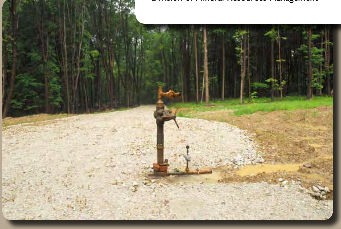
English No.I Well

September 1, 2008 Ohio Department of Natural Resources Division of Mineral Resources Management