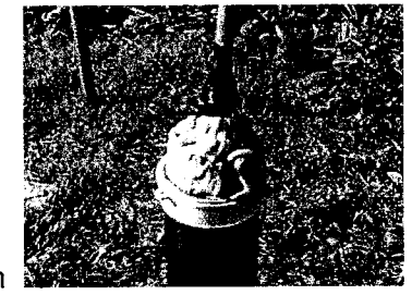
Swab around brush